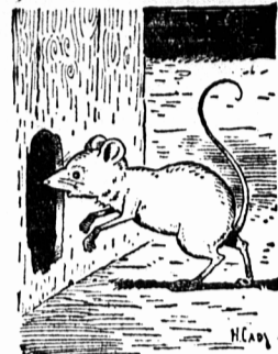
His nose told him that that hole had been much used by Mice.

(By Thornton W. Burgess) ALL ON HIS OWN To some the ways of life are shown. While others learn them on their own. —Old Mother Nature. To be on your own is to make your way in life independently, without guidance, finding out for it. Strange as it may seem many of Mother Nature's children who are the earliest to start out on their own are among the smallest and most timid, the very ones who seem most in need of being shown by father or mother how to live safely. This usually is true of those having large families frequently, like Mice and Rats. Mother hasn't time to teach growing children the dangers of life and how to avoid them, because more babies demand all her care and attention. Mother Mouse is a good mother while her babies are helpless, but she has neither time nor thought for them after they venture out into the great World, which is when they are about half grown. Nibblet, young son of Nibbler the House Mouse, was three weeks old and already out in the Great World on his own. Just then the Great World was a storeroom in Farmer Brown's house. He had been born in a snug warm nest in a drawer of an old bureau stored