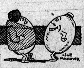
1st Egg: Why the overcoat? 2nd Egg: I'm going to be put into cold storage!

SURE IT WOULD If you were all-fired busy, Grinding out a daily grind Of dope that makes one dizzy; If your mind was in a mist. Of fleeting fancy or sigh, Wouldn't it make you feel sore To be disturbed by the guy Who asks you: "What's the score?"