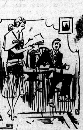
She: "By this paper it looks like we might get back beer and light wines." He: "Well, if we do I'll just knock all the kick out of drinking with everything so darned legal."