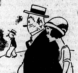
"He's feather-brained." "No doubt; he's always pluming himself on his knowledge."