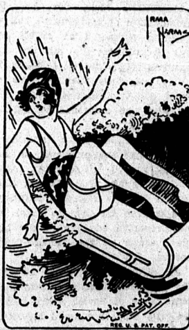
"All's swell that ends swell."