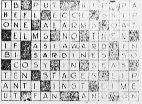
Answer to Puzzle No. 23