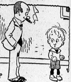
"Papa is it necessary to why me?" "You ought to know." "Well, I sometimes think you don't realize how little good it does me."