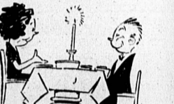
Hostess: What part of the fowl do you prefer? Brown: I've lived in boarding houses all my life and my taste runs from end to end.