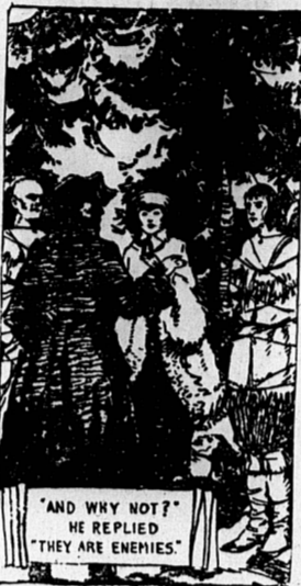
"AND WHY NOT?" HE REPLIED "THEY ARE ENEMIES."