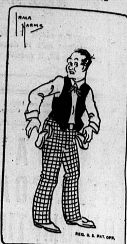
"Often a young man has nothing on which to get married but the date of his wedding."