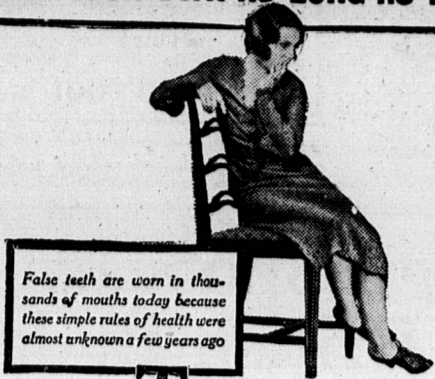
False teeth are worn in thousands of mouths today because these simple rules of health were almost unknown a few years ago