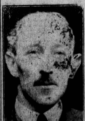
OTHO NICHOLSON, M. P. Member of the British House of Commons for the Abbey Division, who defeated Winston Churchill by 43 votes.

could not attempt to undermine every solid "fill" between Sherman Hill and the town, and when the story of their baffled hopes came to the ears of the division superintendent it left him cold, wherefore to this day every train over the Great Divide crosses also a pretty buried fortune destined never to be seen by man. Do I believe this story, you ask? Absolutely. Every time I go up or down the Sherman Hill, I dream of gold and neat piles of green bills. (Copyright 1924)