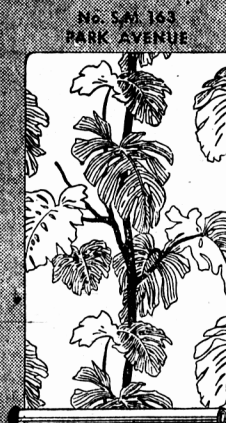
No. S.M. 163 PARK AVENUE

An extremely sophisticated treatment of New York's currently most favoured decorative plant, the Spine Phloxidendron. This is presented on a blue green ground showing a growth with maroon stem and leaves shading from whites to beige and greys. Also shown on grounds of lily white, chartreuse, and oyster.