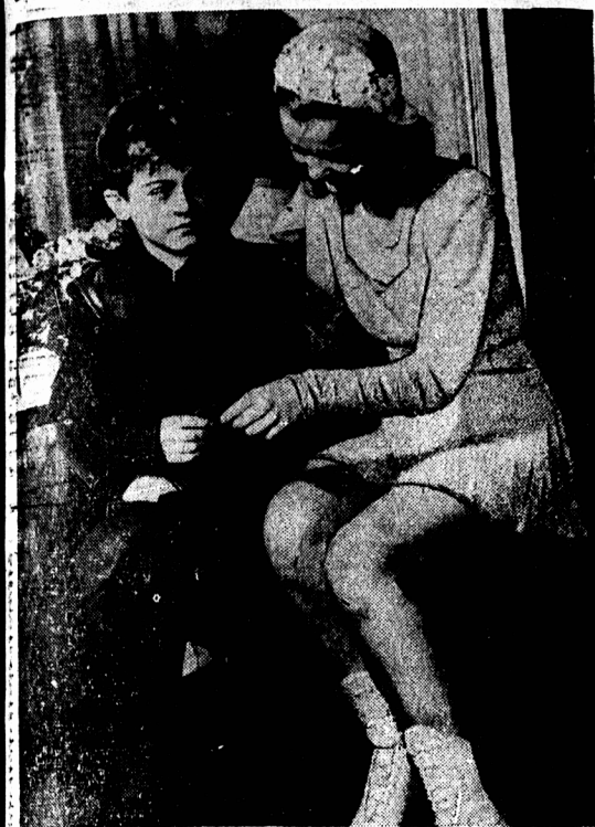
LUCKY YOUNGSTER AND ICE QUEEN