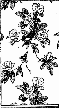
No. S.M. 156 NORMANDIE CARDINAL

This outstanding bird and flower design is treated on a mayfair blue ground, deep green leaves and white magnolia blossoms with the cardinal in burgundy. The pattern is also made on grounds of white, light green, dark green and velvet black.