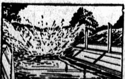
Proved in every way... for dependability and comfort under all conditions. You're in for an experience, not an experiment.