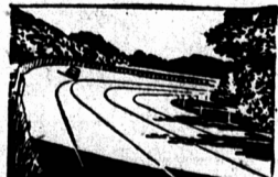
Proved on miles of track... to offer you more speed than you'll ever need. Here's stamina and performance to spare!