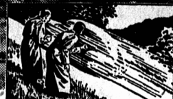
Proved on the toughest grades... the new Chevrolet takes hills in its stride. Its power will thrill you.