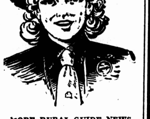
MORE RURAL GUIDE NEWS