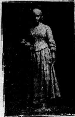
RED CROSS DAY

May the twelfth will be celebrated in every part of the British Empire as "Red Cross Day." The date was chosen because it was the birthday of Florence Nightingale. Henri Dunant, through whose efforts the Red Cross was formed, fully acknowledged that his inspiration came from her, the most wonderful woman in the history of the English race. Florence Nightingale's Contribution.