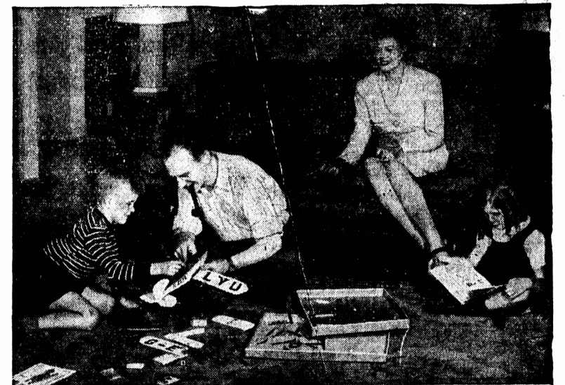
THE PEACE IS NOT WON YET! Canada and her allies are pledged to help the sick, hungry peoples of war-wrecked countries. And every Canadian must be assured of the opportunity to earn a decent living... the money you lend in the Ninth Victory Loan is needed to accomplish this... as well as to help build a strong Canada for your own future prosperity!