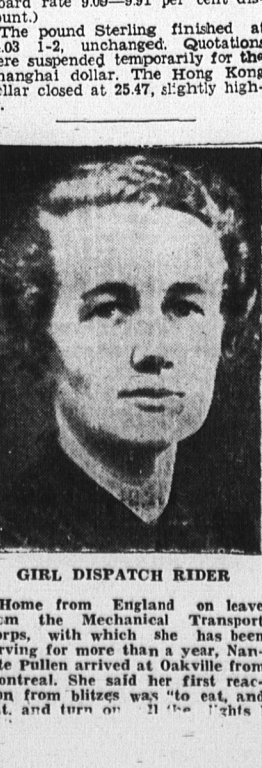
GIRL DISPATCH RIDER. Home from England on leave from the Mechanical Transport Corps...

MONTREAL, Aug. 3-(CP)—The price tone showed improvement on the stock exchange Saturday, but brisk activity at the opening diminished towards the close.