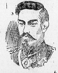
MEIJI KUNO EMPEROR OF JAPAN

TOKIO, Jan. 15.—(Special)—Toshiro Sakatani, Minister of Finance and Isaburo Yamagata, Minister of Communication, have resigned from the Cabinet and their resignations have been accepted.