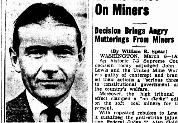
AMBASSADOR DESIGNATE TO BRITAIN