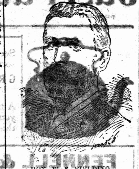
HON. W. S. FIELDING.

One report says no successor to Mr. Blair will be named till after the session. Mr. Fielding acting as Minister of Railways in the meantime.