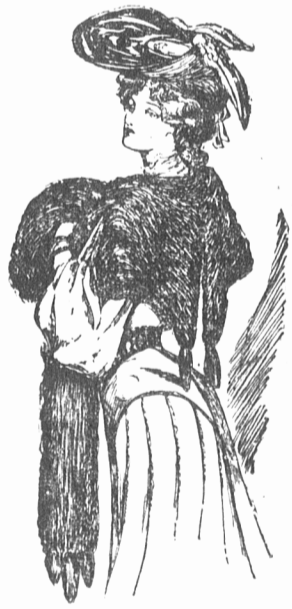
MUFF AND CAPE OF SILVER FOX.

Almost anything is smart in the way of trimming from suede kid bands to