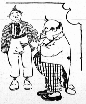
SCARE HIM AWAY First Dutchman—You had been blaying all morning, for why? Second Dutchman—Dis is rent day, under landlord hates moosic.

THE ARCH-FIEND OF THE AGE Not war, more deadly than ever modern this butchery—but Catarrh, which leads to consumption and annually kills more than famine and war combined. The doctors now successfully fight catarrh with a remedy that never fails—"Catarrhzone," it's death to every type of catarrh. It destroys every root and branch of the disease so thoroughly that a relapse need never be feared. If troubled with colds, nasal or throat catarrh, or subject to bronchitis or asthma use Catarrhzone and you'll be cured forever.