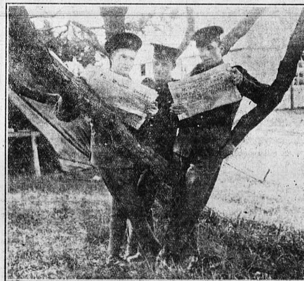
READING THE GUARDIAN IN THE TRENCHES