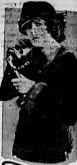
Anita Stewart as "Mary Regan"

Fighting a desperate game to prove to the man she loves that the taint of criminality on her name is a menace to his success, Anita Stewart as "MARY REGAN" visualizes the girl who has the Brains, Beauty and Nerve to toy with Big Business Devotees of Big Pleasure in New York's Midnight Joy Ground, forcing the golden doors to open to her in the glittering underworld of doubtful pasts, memories gone and hopes aswirl.