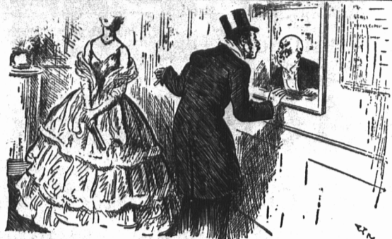
"Have you a box that will take this crinoline, and a single tall for me somewhere else?" -Humorist.