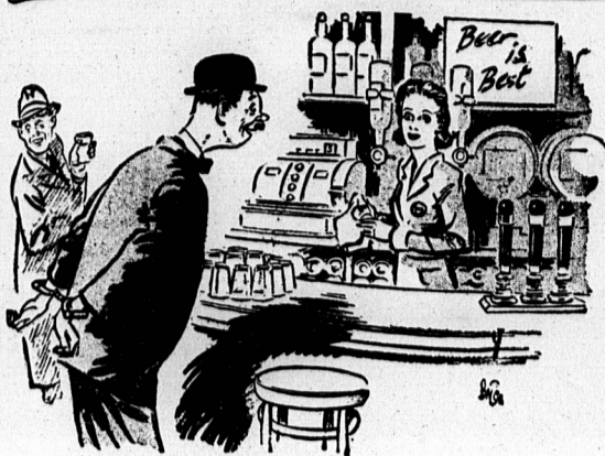
"A half of bitter, please, and I'll have to ask you to pour it down because my wife handcuffed me to stop me nipping out and having one."

MARSHFIELD SCHOOL The following is the Honor Roll for Marshfield School for the month of November: