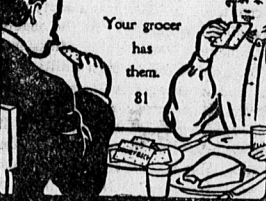
Your grocer has them. 81

Canada's finest crackers, from Canada's finest bakery. Crisp, inviting, delicious. In the lunch pails that keep them in faultless condition.