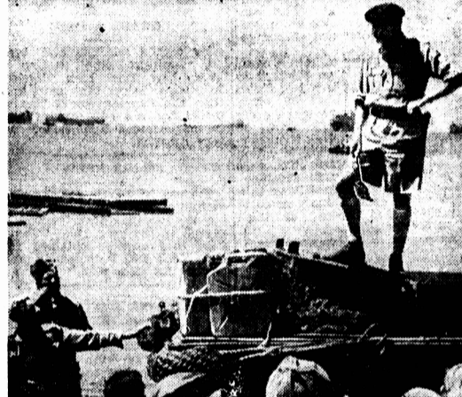
standing on a landing craft, emphasizing his points with the finger in his hand, General Montgomery, famed leader of the British 8th Army, talks to Canadian forces now attached to his command in the Sicilian campaign. "Monty" has bestowed the highest praise on the Canucks for their fighting qualities in Sicily.