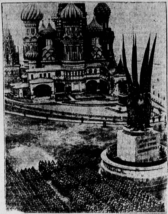
Solid ranks of Soviet soldiers before a statue in Red Square, Moscow, with an old Russian church, reminiscent of the cars, in the background. This photo was taken Nov. 7, during ceremonies marking the 15th anniversary of the Soviet revolution. More than a million soldiers, sailors and workers took part.