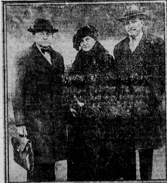
GOVERNMENT COUNSEL STARTS FIGHT TO CANCEL LEASES