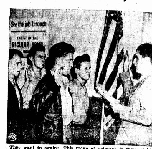
They want in again: This group of veterans is shown taking the oath as they re-enlisted under the Army's new enlistment program.