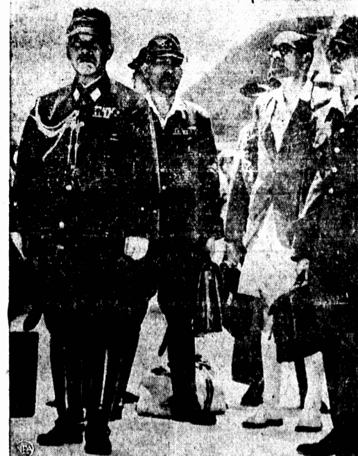
Warned repeatedly against stalling, the Japanese peace mission finally landed on Ie Island, west of Okinawa, on August 17, 1946, en route to Manila to receive surrender instructions. Some were surly, some stoic, some feigned nonchalance, and some bowed and scraped with offerings of flowers. In Japan, the government was having trouble convincing its fighters that they were beaten. Some Kamikaze attacks continued.

Both the men and officers are angered by the sudden change of the civilian attitude toward them. 'The war is over, bud; you're just another soldier now,' is heard with increasing frequency. And since reading 'No Military Personnel Allowed' are slowly beginning to reappear in cities and towns near Army posts.