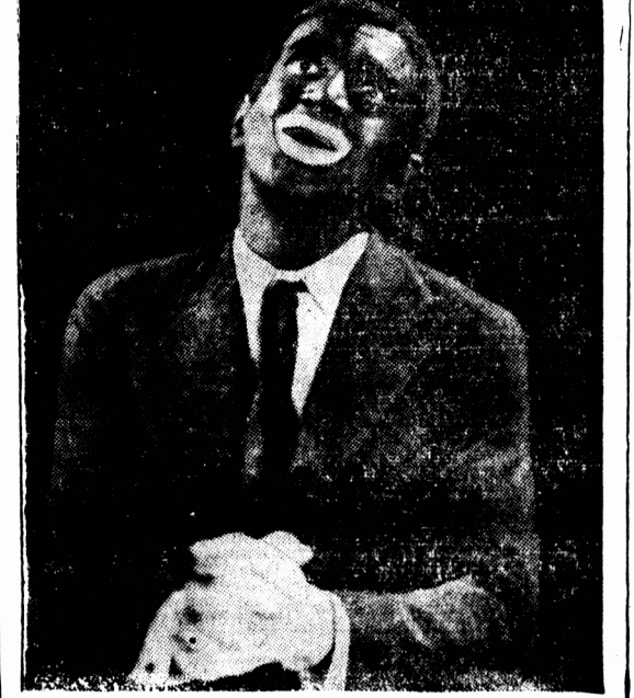
A Famous First - When Al Jolson, in Warner's historic film, 'The Jazz Singer,' sang the famous song, 'Mammy,' the screen musical production was born. It happened 20 years ago, when Warner's pioneered sound.