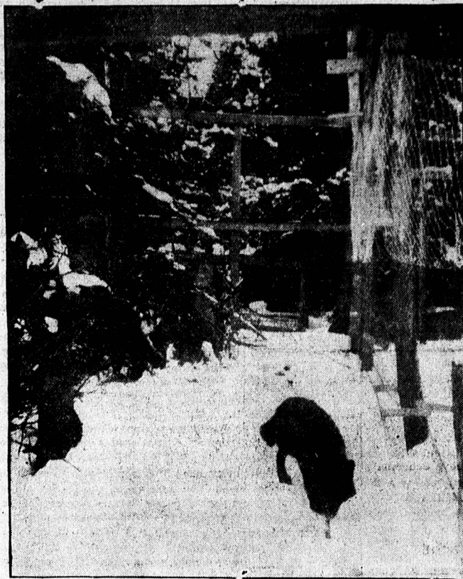
A WINTER SCENE IN A FOX RANCH WITH REYNARD IN THE FOREGROUND.