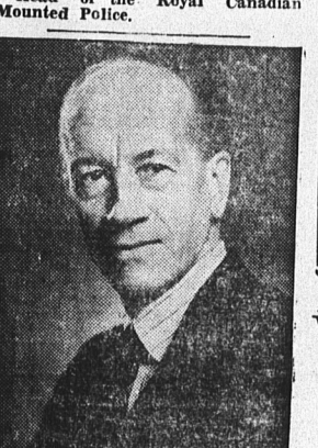
JOSEPH T. THORSON, Minister of National War Services, Ottawa.