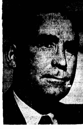
Premier Campbell of Manitoba

WINNIPEG, Oct. 27 — (CP) — Premier Douglas L. Campbell's coalition Government received 18 seats on a platter today when nominations closed for Manitoba's Nov. 10 provincial election.