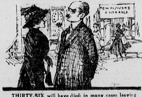
THIRTY-SIX will have died; in many cases leaving families enduring hardships—