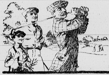
FOUR will be well-to-do and able to enjoy comfort and recreation—