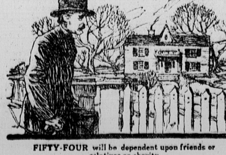
FIFTY-FOUR will be dependent upon friends or relatives or charity.

You, perhaps, have the same ambition. At least, you want to be well-to-do later on, and able to enjoy life in comfort and independence.