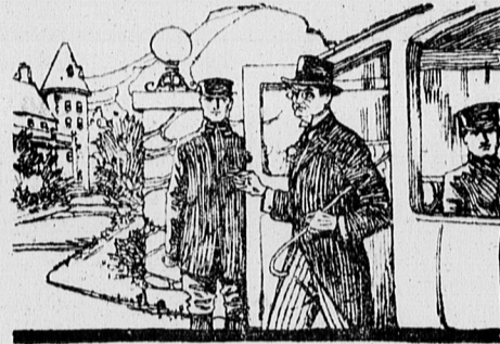
ONE only will be wealthy—