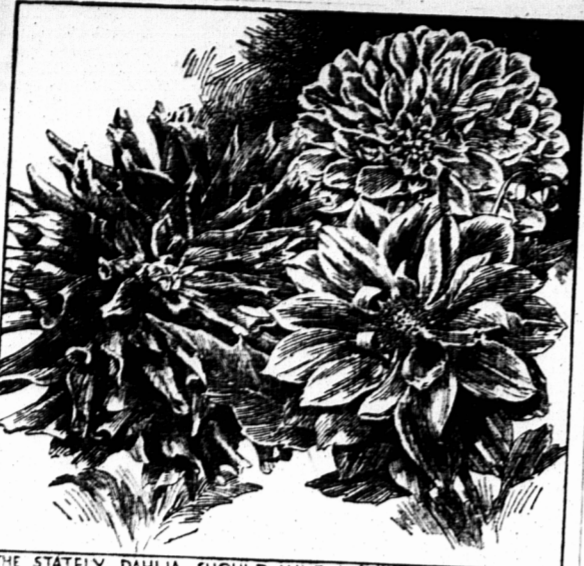
THE STately DAHLIA SHOULD HAVE A PLACE IN EVERY GARDEN.

No garden is complete nowadays without a display of dahlias. This plant is one of the modern miracles of skilled horticulture, and tribute to the art of the hybridizer who has produced gorgeous creations ten inches across in dazzling colors. The crossing of the various types has, in a measure, blotted out the old-time class lines and the finest types are now hybrids of the small flowered cactus with the huge, peony flowered types and others into loose wide petaled forms as big as one's head. Dahlia plants can be secured