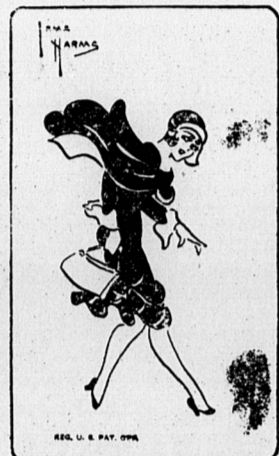
"Girls walk home from automobile rides still. If they talked it would be censored."