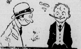
"Unhappy lies the head that wears a crown." "So I've heard, but I wouldn't mind a little attack of nervous double like that."