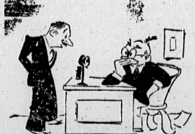
Her Suitor: No, sir, I do not want to marry your ward for her money. Absolutely not. The Guardian: Then you haven't got as much sense as I thought you had.