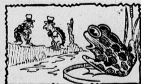
First Turtle: What's old man Bull Frog croaking about now? Second Turtle: Same old thing, nothing at all. Just likes to hear his voice, I guess.

Across the mountain and the plain The wind an autumn flavor blows. And as we shiver we exclaim: "Where are my pants and underclothes?"