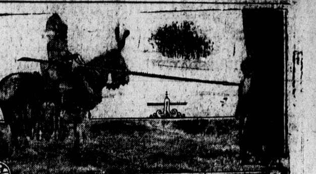
From the CONNECTICUT YANKEE IN KING ARTHUR'S COURT WILLIAM FOX PRODUCTIONS

The Drummer. "I sometimes think," remarked the regular patron, "that the squeaking drummer should be the best music in the theatre orchestra." "He usually is," said the drummer.—Chicago Tribune.