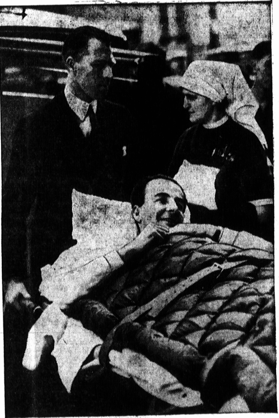
Earl Beatty, seriously injured four months ago in a hunting accident, was only recently able to be moved to his London home in Grosvenor Square, from the War Memorial Hospital in Melton Mowbray, Leicestershire. The hundred-mile trip was made in a special ambulance with two nurses in attendance. Earl Beatty will be bed-ridden for some time yet, doctors report.