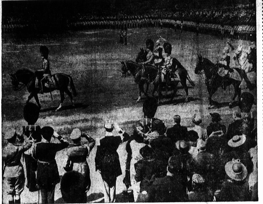
Above, wearing the uniform of Colonel-in-Chief of the Scots Guards, King George is shown riding on to the Horse Guards Parade in London, for the ceremony in observance of his birthday. Behind him are the Duke of Kent and the Duke of Gloucester (the farthest from the camera.)