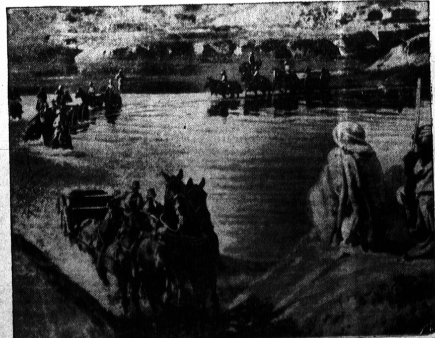
A long sharp thorn in the flesh of the military authorities in India is the Fakir of Ipi, who has kept the warlike Waziristan tribes on the northwest frontier in almost chronic revolt for months. A recent outbreak necessitated the sending of a strong punitive expedition accompanied by bombing planes which brought the realities of battle home to the rebels in the most literal sense by raiding their villages. Above is seen a detachment of the Royal Horse Artillery fording a stream near the scene of trouble, under the watchful eyes of two natives squatting on the bank.