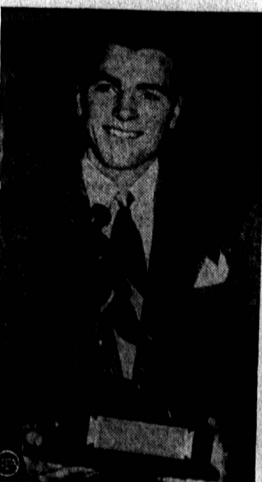
Chosen by a poll of U. S. sports leaders as the amateur who, during the year, has most advanced "the cause of sportsmanship," Olympic deapthlon champ Bob Mathias was awarded the James E. Sullivan Memorial Trophy at the N.Y.A.C.

The Juvenile Vics, by defeating the Abegweits in a sudden-death game over the week-end, earned the right to play a home and home series with the Summerside Sheen and McInnis Juveniles in the semi-finals for the Island juvenile hockey title. The first game of a home and home series with Summerside takes place at the Forum this evening at 7:30 when the Vics will be at home to the Summerside boys. The second game takes place at Summerside tomorrow (Tuesday) evening. The winner of this series will meet Bordgen for the Island juvenile hockey title.