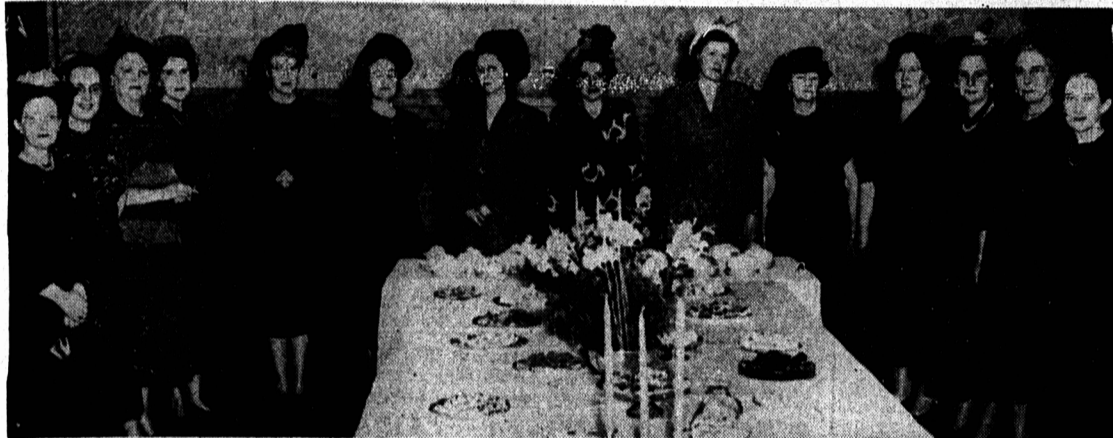
Above is pictured a group of the ladies representing the Ladies Auxillary and Y's Menettes who served tea at the opening of the "Y" Wednesday afternoon.