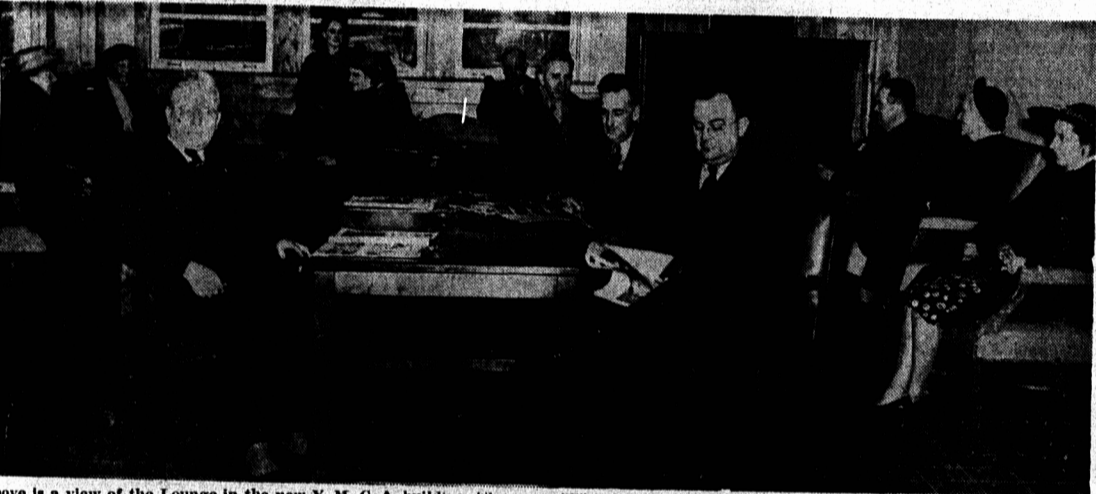
Above is a view of the Lounge in the new Y. M. C. A. building. The new "Y" is located at the corner of Prince and Euston Streets.