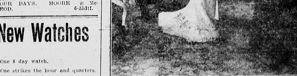
Scene in Act Three in "The Mummy and the Humming Bird" Opera House tonight by the famous Paul Gilmore Company.