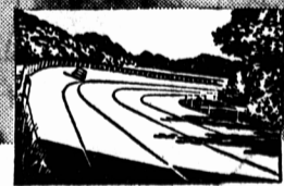
Proved on miles of track... to offer you more speed than you'll ever need. Here's stamina and performance to spare!

Tested and Proved... on the world's toughest Proving Ground