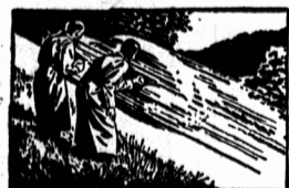
Proved on the toughest grades... the new Chevrolet takes hills in its stride. Its power will thrill you.