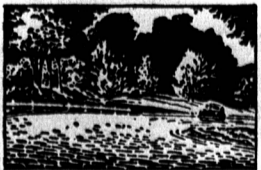
Proved in every way... for dependability and comfort under all conditions. You're in for an experience, not an experiment.

Dependable? It came through the roughest, toughest tests... Came through with flying colors!