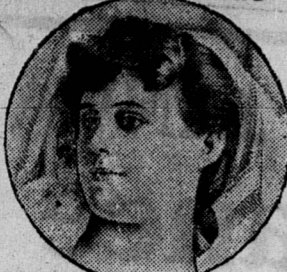
Read My FREE Offer.

I am a woman. What I have suffered is a far better guide than any MAN'S experience gained second-hand.