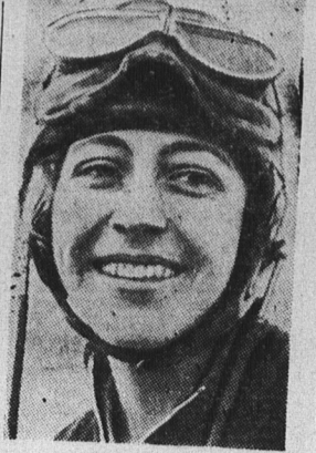
CLAY PIGEON Amy Johnson Mollison, Britain feminine glory flier, was killed flying across the Thames.