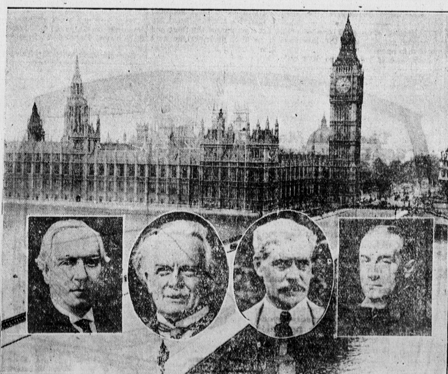
PARTY LEADERS WHO ARE FIGHTING FOR THE PREMIERSHIP OF GREAT BRITAIN After a hectic career of nine months, Ramsay MacDonald's Government was forced to appeal to the country to either support or reject its policies. In the above layout is shown the most famous seat of government in the world: the British Houses of Parliament. This view was taken looking across Westminster Bridge, and shows the Thames River. The inserts are, from left to right: Rt. Hon. H. Asquith, Liberal; Rt. Hon. David Lloyd George, Liberal; Rt. Hon. J. Ramsay MacDonald, Labor, and Rt. Hon. Stanley Baldwin, Conservative. All are former Premiers except J. Ramsay MacDonald, who is the present Premier. According to the first official list, 530 Conservatives are in the field to contest 615 seats. This is considerably in excess of the number of Conservative candidates in the last