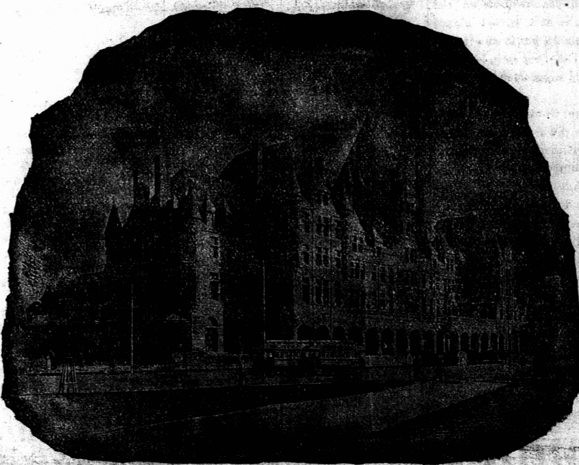
C. P. R. Depot, Montreal.

held told that he would have to wait! Oh jubilate! How he howled! After laying his dire distress before the porter accompanied by something tangible the supplicant navigated for the hook on which to hang up his hat and coat and nothing more was heard or seen of him until the following day. After arriving in Montreal a number of those on board deserted the train, the writer among the number. After dinner at the Queen—an excellent house—Mount Royal was visited by the aid of the incline railway. By the way there is some friction between this company and the Montreal City Council. The Company declines to reduce its fares as ordered by the Council and refuses to remove its plant or recognize the right of the City to do anything but renew its running arrangements or purchase the plant by expropriation. The writer expected to find the rate reduced from eight cents to seven but was told that the company not feeling bound to carry out its suggestion of reduction to seven, will continue the eight cent rate. In the afternoon Notre Dame and St. James' Church were visited. Montreal is noted for its cabmen and visitors with a limited supply of one of these gentlemen very trying. Leaving Montreal in the evening the next place of interest—not staying at the Falls on the way—will be Buffalo.