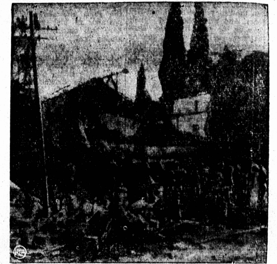
British soldiers examine wreckage of a barracks that was blasted when two Jewish terrorists blew up a police station beside British headquarters in Tel Aviv, killing four British policemen and injuring five others.

In a circle. Bold plaid shirts and full-skirted dresses of the dancers are woven in different textures as well as in varied colors. The designer works out the patterns on graph paper after which they are made up by weavers.