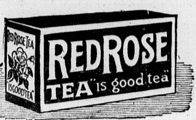
Red Rose Coffee is as generously good as Red Rose Tea

Make a brewing and you will find all these qualities combined in Red Rose.