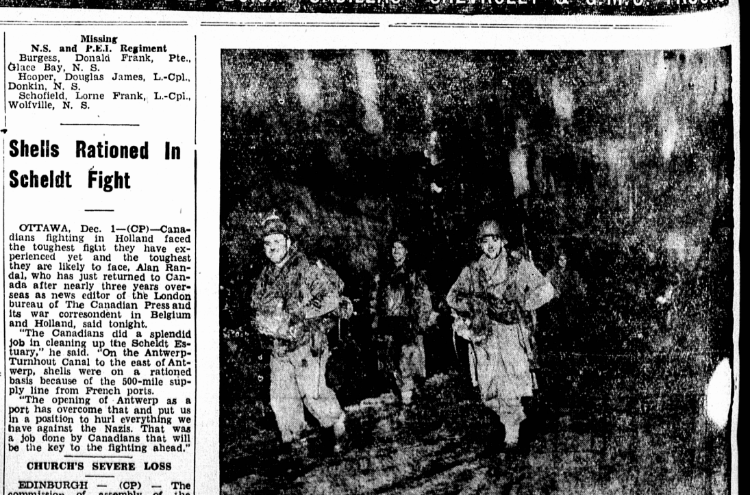
In case you think G. I. Joe is having a cushy time of it, chasing Germany on the Western Front, let this photo disillusion you. It shows Seventh Army infantrymen slogging along a road near Langsette, France, under a downpour of rain, and sleet.

CHURCH'S SEVERE LOSS EDINBURGH—(CP)—The commission of assembly of the Church of Scotland was told that 10 per cent of its chaplains had been killed in action since D-Day. The commission asked younger ministers to volunteer for replacement duties with the fighting troops and in occupation of Germany. Minard's Relieves Sprain.