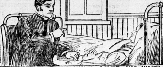
PASTOR SAID PSYCHINE SAVED HIS WIFE