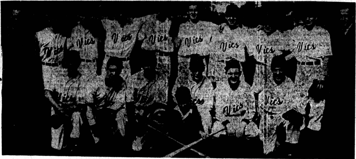
Pictured above are the newly organized Victoria Junior Baseball Team who are in second place in the City Junior League.