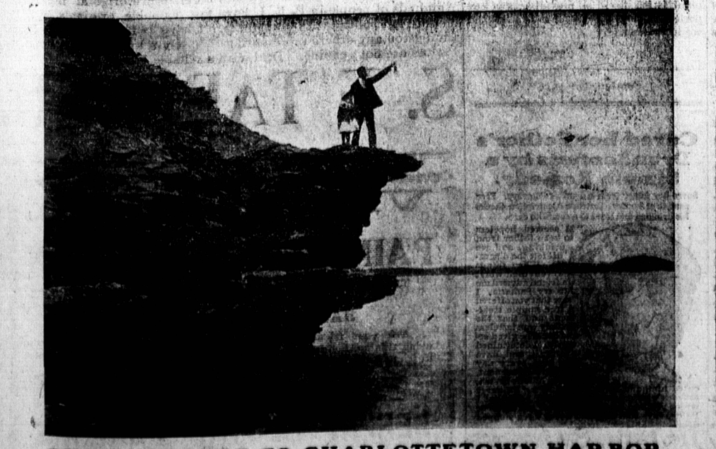
THE ENTRANCE TO CHARLOTTETOWN HARBOR.

THE ICONOCLAST A TYPE. Swerveless my way—straight through blood and fire— Socialist, Anarchist, Regicide! Stigmatic words, that Centuries past Have burned and branded in my name, Till some one hissed, "Iconoclast."