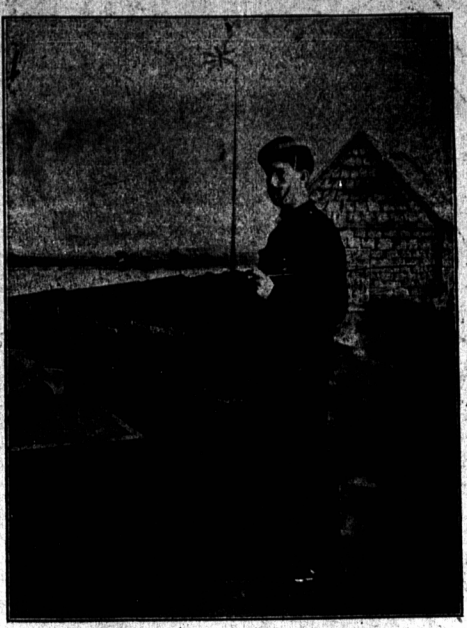
FORT EDWARD Have your photo taken with this background at our studio.