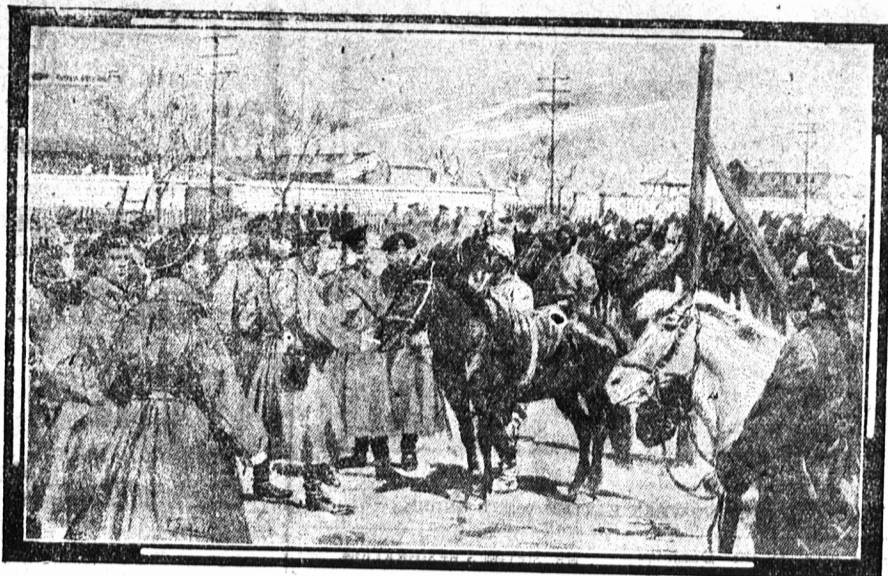
THE RUSSIANS BUYING HORSES TO AID IN RETREATING.

Hon. Mr. Foster charged that the whole affair was a deliberate attempt to force Sifton from the Cabinet.