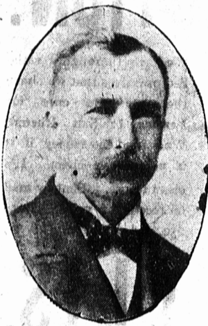
HON. CLIFFORD SIFTON

Announced by Sir Wilfrid Because Unable to Accept Separate School Policy—Sir Mackenzie Bowell Repeats His Epithet, "A Nest of Traitors," Applied to His Colleagues of 1896.