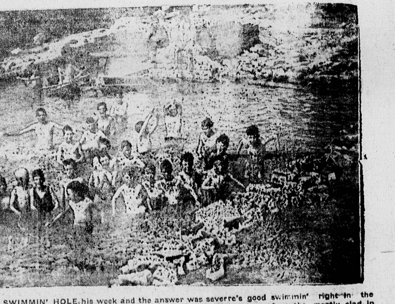
BASEMENT FOR HOME BECOMES OL' SWIMMIN' HOLE. His week and the answer was severe's good swimmin' right in the back yard." The call echoed over Cedarvale, Ontario, one hot day "Oh! Skinny! Come on over! Heat score of youths, mostly clad in natural, enjoying a dip in an excavation for a residence, which had become filled with water.

Canada, like the United States, has a large percentage of automobiles on farms. In many districts in the prairie provinces where registered in Canada now number second to the United States as the greatest automobile owning nations.