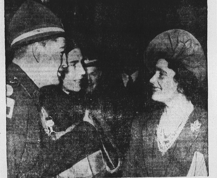
In her unswerving round of visits to the troops in Britain, her majesty displays a special kindness for the men from the dominions overseas.